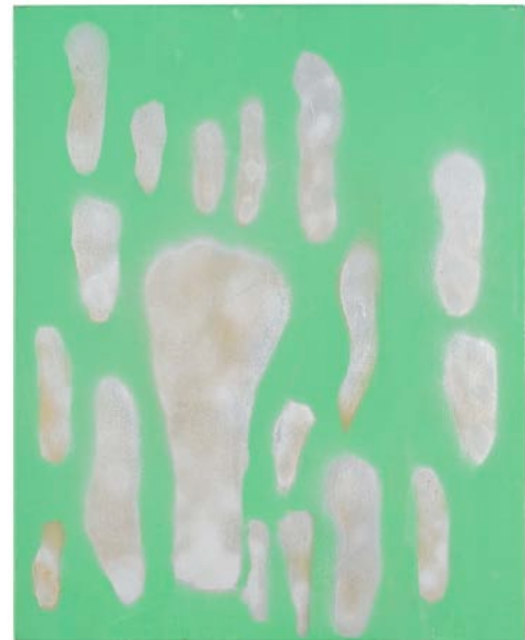
Absurde n°13 [Absurd no. 13] , 2011 Acrylic on canvas 100 cm x 67 cm