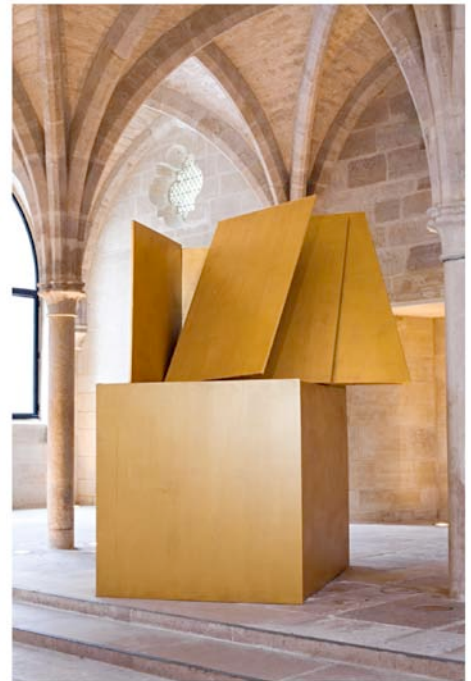
Constellation , 2010 Wood, acrylic paint 180 cm x 200 cm x 200 cm Installation view, Collège des Bernardins, Paris Photo: Antoine Delage de Luget, 2010 Courtesy Jérôme Poggi galley, Paris