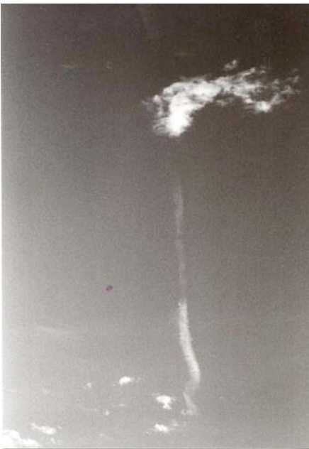
Nuage n/b [Cloud b&w], 2011 15 min video loop