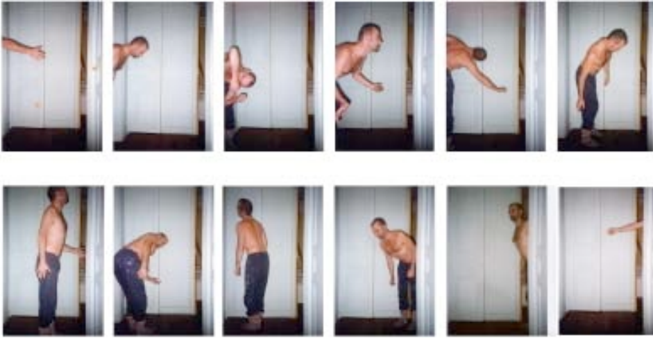
Le Couloir [The Corridor], 1995 12 photographs each 37 cm x 23 cm