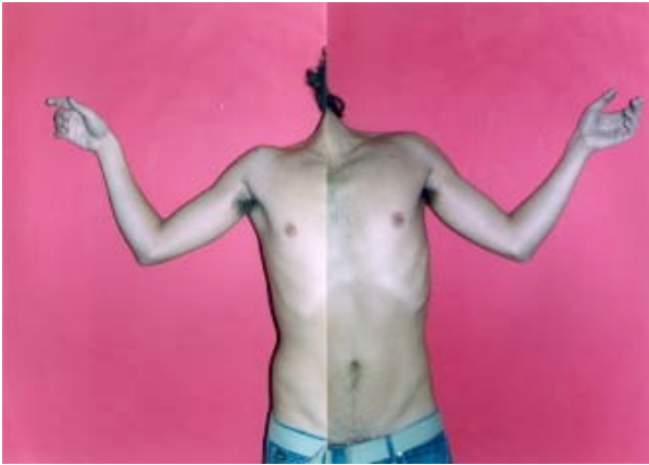
Anonyme défait [Unmade unknown] , 2004 Photograph 100 cm x 75 cm Private collection, Paris