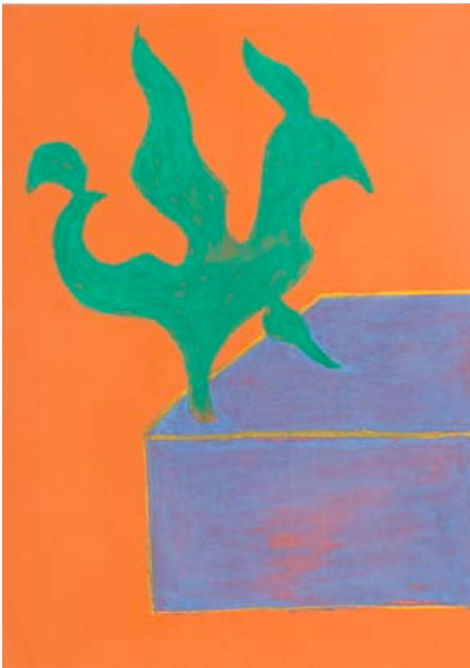
Dessin anonyme [Anonymous drawing] , 2007 Pastel on paper 50 cm x 65 cm