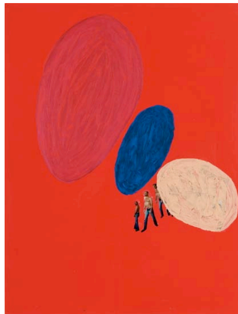
Rouge, bleu, jaune [Red, Blue, Yellow], 2007 Photcollage and acrylic on paper 50 cm x 65 cm