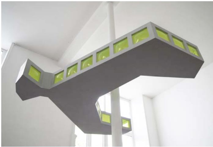
Airedificio , 2007 Mixed media 191 x 240 x 210 cm Courtesy Galerie GP & N Vallois © Aurélie Godard