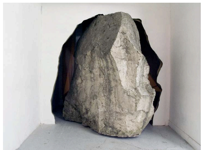
Passe Apache/Apache Pass , 2005 Resin, wood, metal 246 x 246 x 100 cm (with door frame) FRAC Ile-de-France Collection, Paris Courtesy Galerie GP & N Vallois © Stéphane Thidet