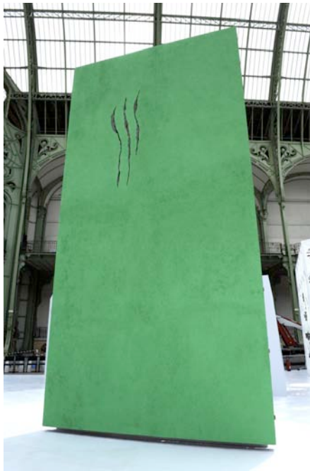
Il y a 140 millions d'années, un animal glisse sur une plage fangeuse du Massif Central [140 million years ago, an animal slips on a muddy beach in the Massif Central], 2009 Solid polystyrene, roughcast 800 x 350 x 200 cm Edition of 1 Exhibition view, La Force de l'Art 02 , Grand Palais, Paris, 2009/Ministry of Culture and Communication