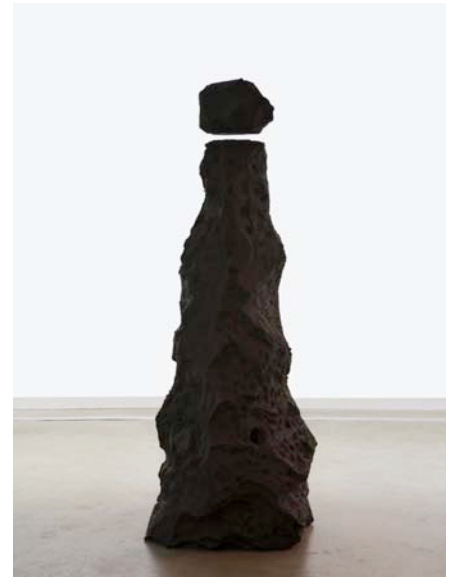
Bird's-eye View , 2010 Polystyrene, acrylic resin 230 x 82 x 82 cm Courtesy Galerie GP & N Vallois © Vincent Blesbois