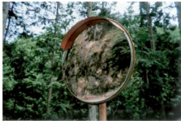
Scénario Fantôme 80/Ghost Scenario 80 , 2010 2 C-prints Each 6 x 9 cm