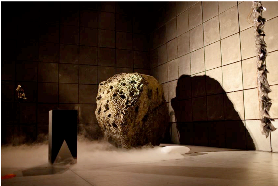
Ils traversent les pistes sur des morceaux de tissus pour ne pas laisser de trace [They cross the tracks on pieces of fabric so as to leave no trace] Theatre piece for children by Virginie Yassef, La Gaîté Lyrique, 7–15 April 2012