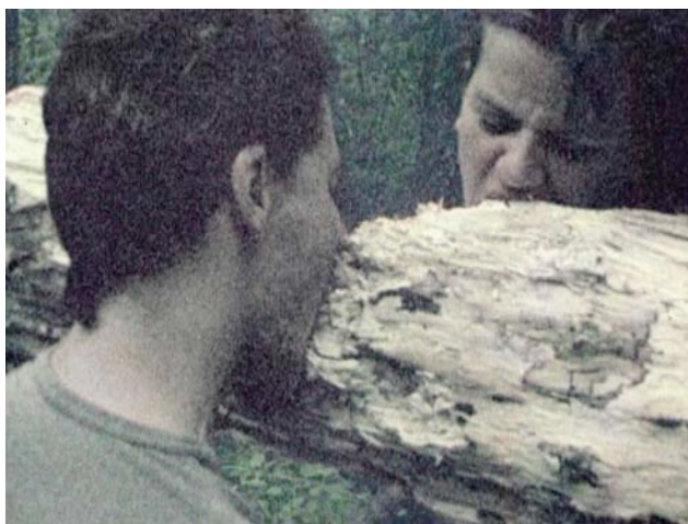
L'arbre/The Tree (in collaboration with Julien Prévieux) 2009 Super-8 film transferred onto DVD 7 min Edition of 4 + 2 artist's proofs (camera: Aurélie Godard) Courtesy Galerie GP & N Vallois