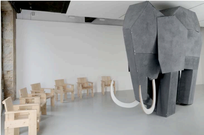
Pour la réveiller, il suffit d'un soufflé [Just a breath will wake her up], 2008 Mixed media: wood, roughcast, screws, sound system, 6 wooden chairs Elephant: 230 x 400 x 150 cm Chairs: each 55 x 80 x 54 cm Exhibition view, Wake Up, Please , Le Quartier, Quimper, France (3 July – 25 October 2009) Collection Frac Languedoc-Roussillon

In 300 dpi on request: marjolaine.calipel@noisysesec.fr T: +33 (0)1 49 42 67 17 Exhibition views available December 2012