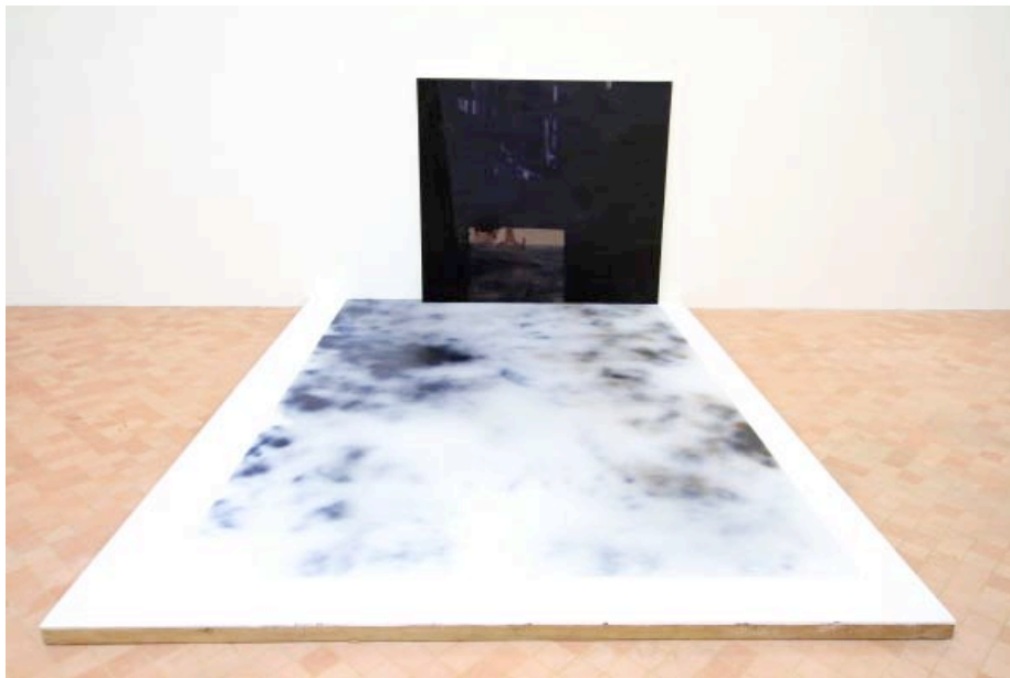
Berlin nuit (Night berlin), 2011 Oil on canvas and painting, 190 x 170 cm spraypak paint on plywood, 300 x 400 cm Exhibition view, Ecotone, at the Maison des Arts Georges Pompidou, Cajarç

In 300 dpi on request: marjolaine.calipel@noisylesec.fr Tel. +33 (0)1 49 42 67 17 Exhibition views available mid-September