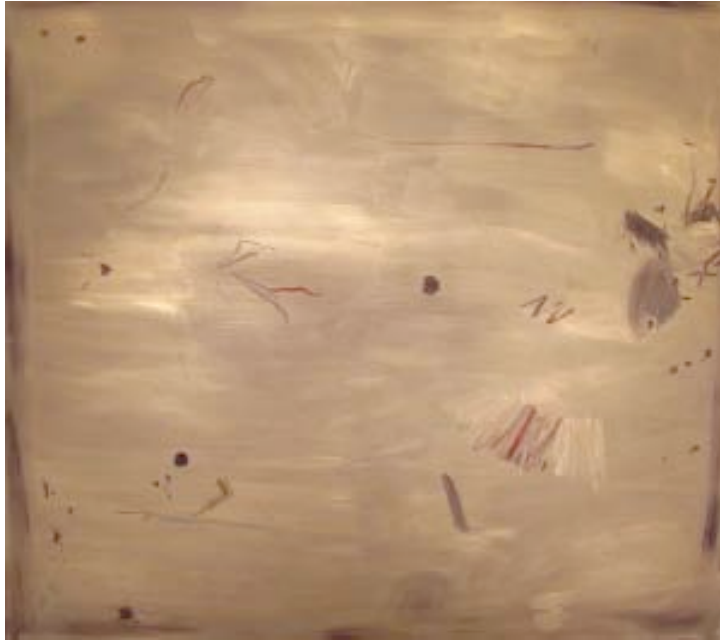
l'une et l'autre (the one and the other), 2012 Oil on canvas 180 x 200 cm