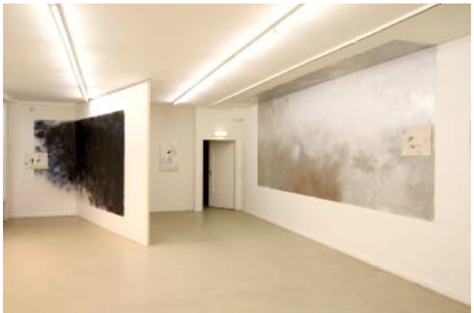
Musique de chambre (Chamber Music) 2011 Exhibition view, "Ecotone", Kunstverein Tiergarten, Berlin