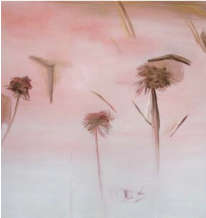
figure 2 , 2012 Oil on canvas 180 cm x170 cm

In 300 dpi on request: marjolaine.calipel@noisylesec.fr Tel. +33 (0)1 49 42 67 17 Exhibition views available mid-September