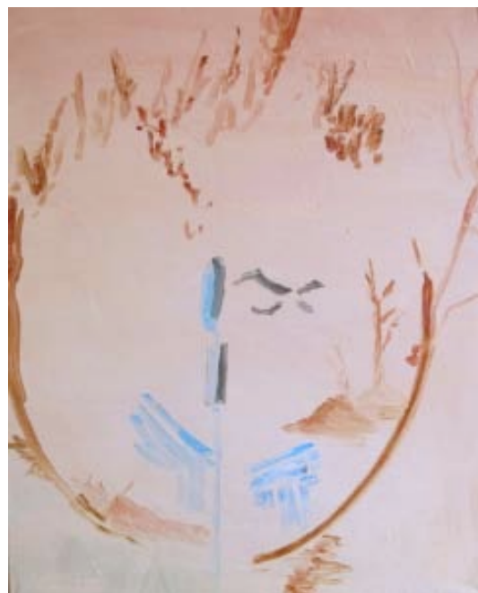
old winter , 2012 Oil on canvas 62 x 52 cm