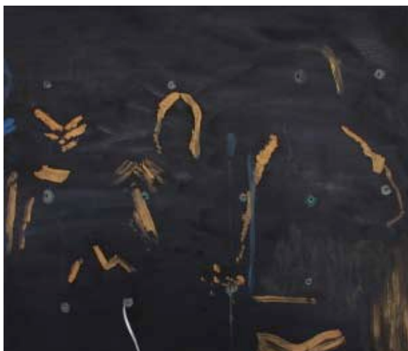
communauté perdue (lost community), 2012 Oil on canvas 60 x 80 cm