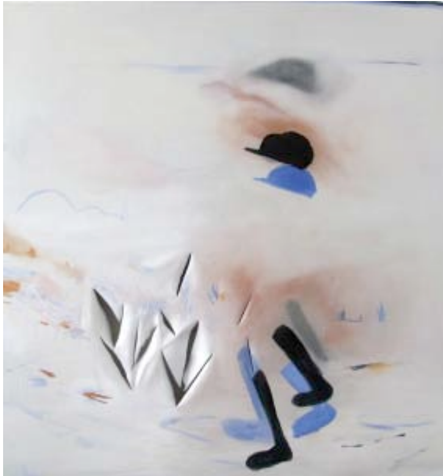
as I was going along , 2012 Oil on canvas, 180 x 170 cm