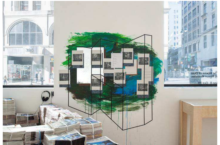
A HOUSE OF HAIR / IN A HOT CLIMATE / EXISTING IN DARKNESS / INHABITED BY PEOPLE WHO SLEEP ALMOST ALL THE TIME (quatrain from "The House of Dust" by Alison Knowles) Exhibition view, "The House of Dust by Alison Knowles", James Gallery, New York, 2016