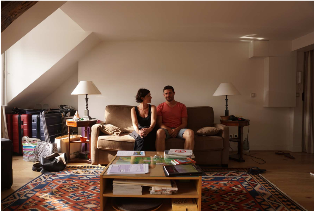
The Interloper, 2017