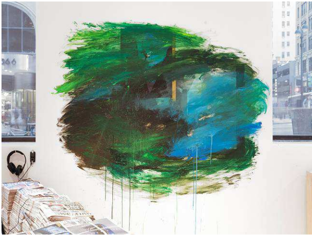
October 12, 2016 Exhibition view, "The House of Dust by Alison Knowles", James Gallery, New York, 2016