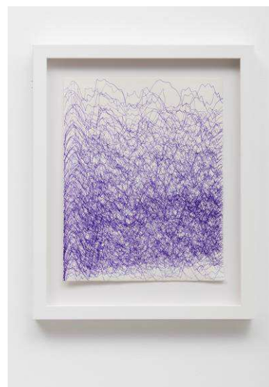
Intensities , 2015 Ink on paper 24 x 31cm