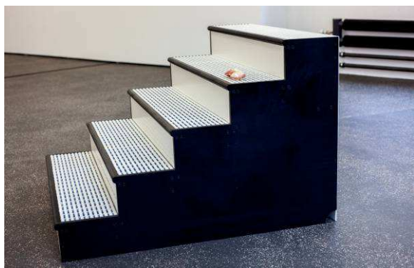
Soft Water , 2015 Olympic pool stairs, polished shells 120 x 90 x 132cm