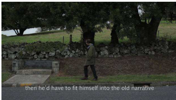
Structure narrative pans , 2012 Video Still