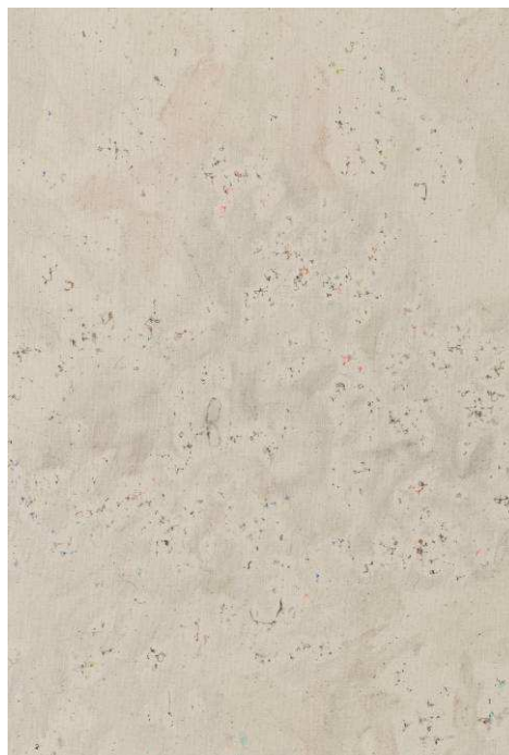
Detail from Als ein Kind den anderen von den gestohlenen Äpfeln erzählte / When One Kid Told The Others About The Stolen Apples , 2015 Pencils on canvas