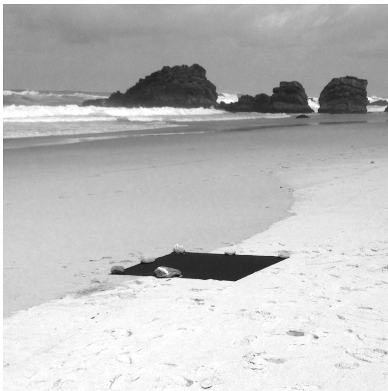
Renato Leotta, work in progress Aventura, Peripezia , 2016.