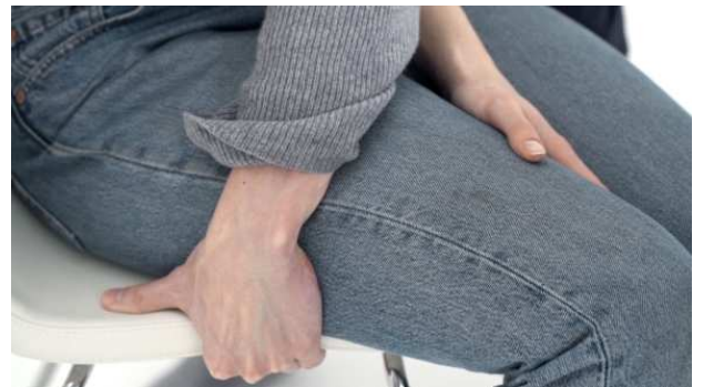
Shoulder Blades , 2016 Video still