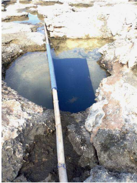
Work in progress for Aventure, Aventura, Peripezia , 2016