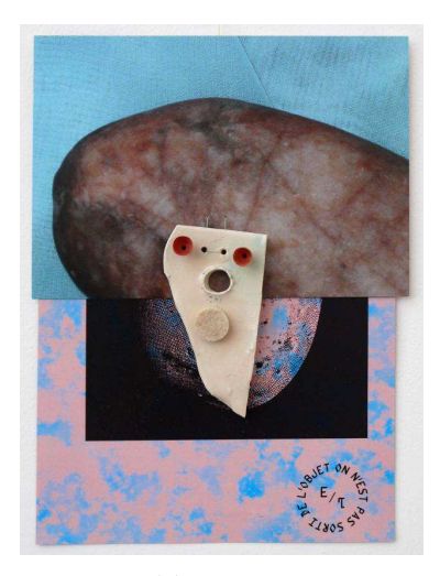
Comédien (T), 2014 Sewn and suspended invitation cards, enameled ceramic, felt, dried plants, thread, nail, 36 x 15 x 2 cm Ceramic produced by La Galerie, centre for contemporary art of Noisy-Le-Sec