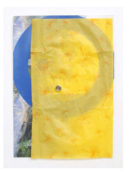
Comédien (F), 2014 Plastic sheet glued on invitation card, thread and snap fastener, nail, 21 x 15 cm Unique work