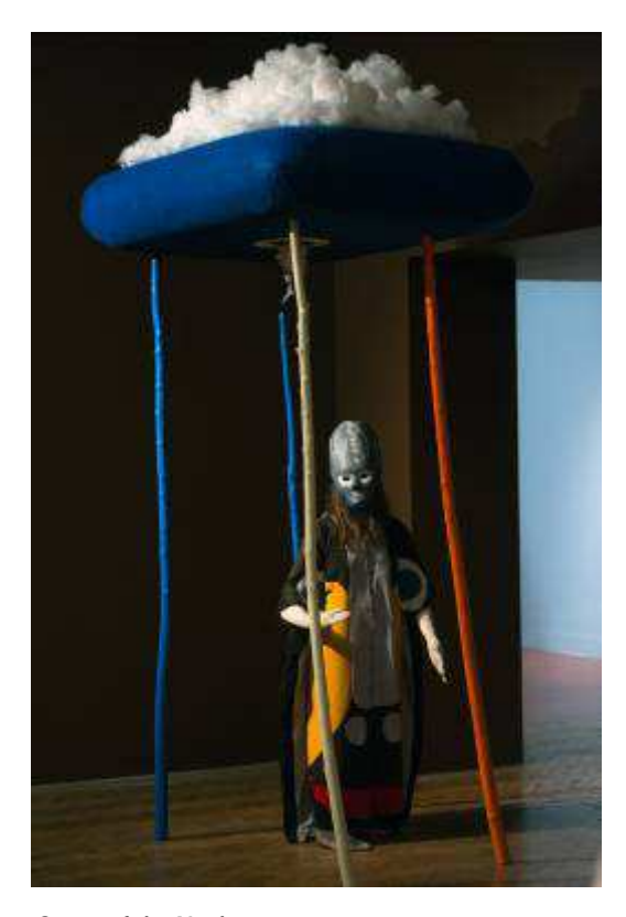
Crane of the Neck, 2014 Performance still, in collaboration with Florence Peake Chapter Gallery, Cardiff