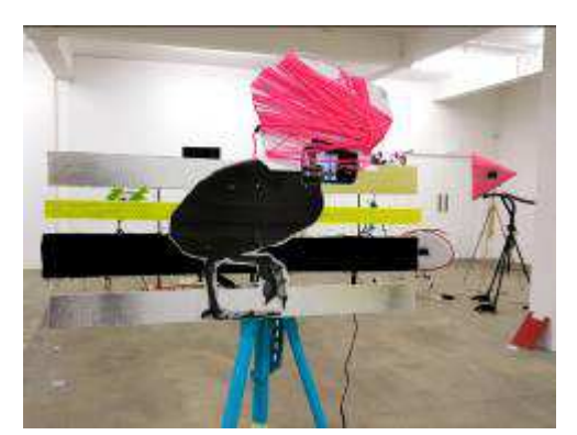
Head Cleaner Bird, from the series TO DO, 2011 Exhibition view, Matt's Gallery, London