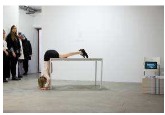
Reading, 2015 Performance, duration 20 min kim? Contemporary Art Centre, Riga