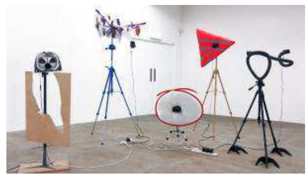
TO DO, 2011 Installation shot from Matt's Gallery, London