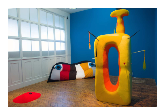
Yellow Figure(after Hepworth), 2014 and Impassive Bean Bag, 2014 Exhibition view, Chapter Gallery, Cardiff