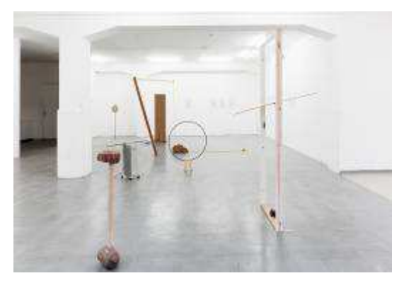
Exhibition view from Skånes Konstförening, Malmö