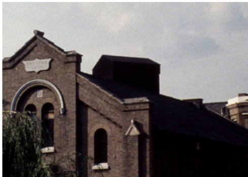
The Black Tower , 1985–1987 16mm film transferred on HD video, colour, sound, 24'