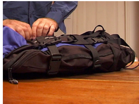
unusual Red cardigan , 2011 SD video, colour, sound, 13'