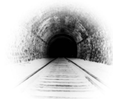
White Hole , 2014 HD video, black and white, sound, 7'