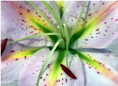
The Kiss , 1999 Collaboration with Ian Bourn 16 mm film transferred onto SD video, sound, 5'