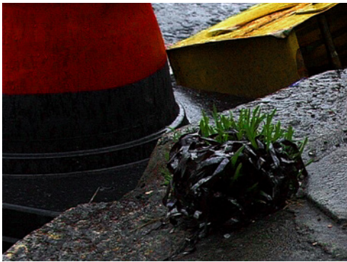
Lost Sound , 1998–2011 Collaboration with Graeme Miller SD video, colour, sound, 28'