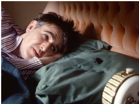
Gargantuan , 1992 16mm film transferred on HD video, colour, sound, 11'