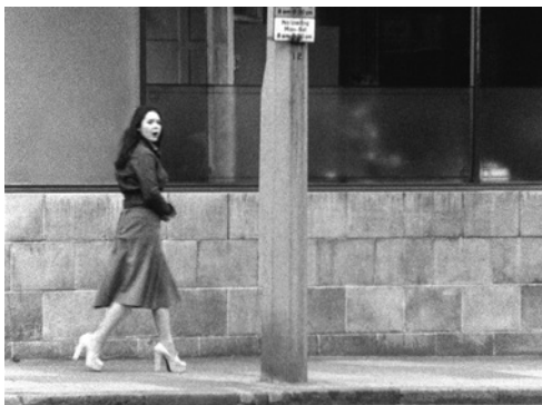
The Girl Chewing Gum , 1976 16mm, black and white, sound, 12'