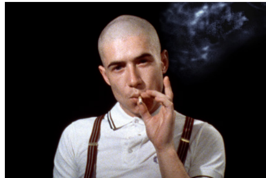
Om , 1986 16mm film transferred on HD video, colour, sound, 4'