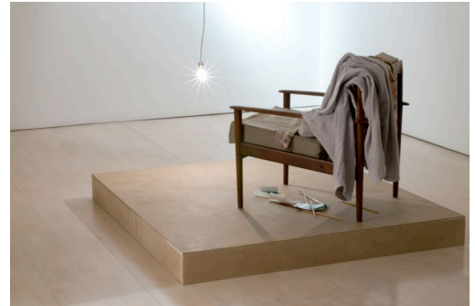
Clare Gasson, The Washaway Road , 2008 Sound piece, stage, chair and light