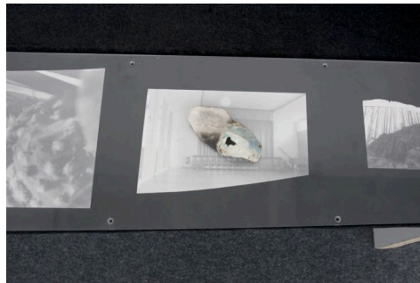
Reto Pulfer, Aquariumspiel in 128 Zuständen (PMG) (detail), 2007 Aquarium, wooden furniture, velvet, 4 pictures b/w, ceramic Variable size (ca. 65 cm x 80 cm x 70 cm)