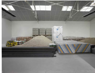
Lara Almarcegui Matériaux de construction (Building materials), 2003 Exhibition view of "1:1 x temps, quantités, proportions et fuites" at Frac Bourgogne, Dijon, 2003