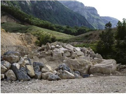
Beat Lippert Métamontagne 1 , 2007 C-print, 50 x 70 cm