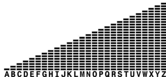
Angela Detanico & Rafael Lain Pilha , 2003 Writing system

High definition images are available on request. Contact: Mélanie Scellier T : + 33 (0)1 49 42 67 17 - melanie.scellier@noisylesec.fr - lagalerie@noisylesec.fr