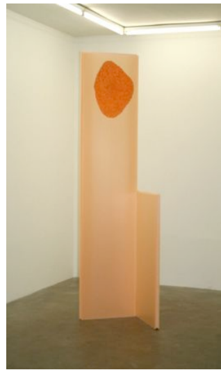
Gyan Panchal nistan , 2008 Extruded polystyrene 260 x 35 x 62 cm