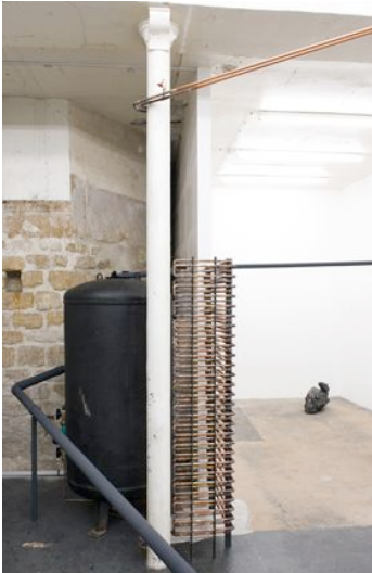
Katinka Bock L'angle chaud , 2007 Heating system, copper, steel, rainwater 78 x 37 x 174 cm View of "Baume wachsen und Ströme fließen: Wasser, Wärme, Monument", solo exhibition at Galerie Jocelyn Wolff, 2007