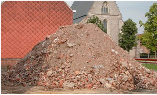
Lara Almarcegui Montagne des débris , 2005 Sint Truiden, Belgium