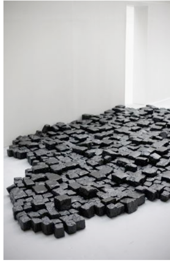
Katinka Bock Le sol d'incertitude (Ground for Uncertainty), 2007 14 sq. m, Paris cobblestones, tar View of "Katinka Bock, volumes en extension", solo exhibition at Centre d'art Passerelle, Brest, 2007