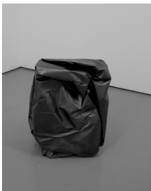
Diogo Pimentão, Envolto [Wrapped], 2009 Paper and graphite 66 x 41 x 24 cm