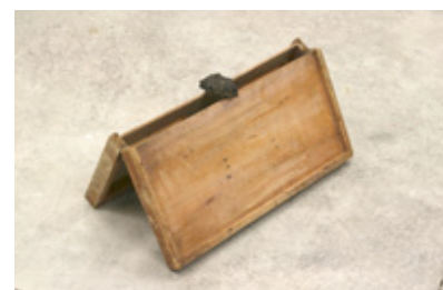
Mathilde du Sordet, Construction , 2007 Wood, lump of tar 33 x 37 x 41 cm

300 dpi pictures available upon request to Marjolaine Calipel Ph: +33 1 49 42 67 17 – marjolaine.calipel@noisylesec.fr