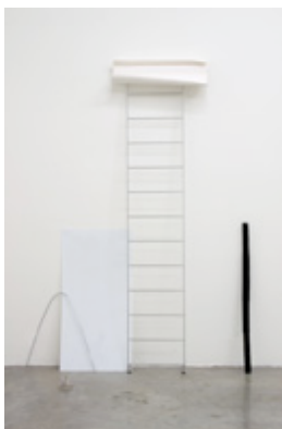
Mathilde du Sordet, Totem-Échelon [Totem-space], 2009 Aluminium, plaster, metal rod, flexible PVC, vertical shelf support, drawing paper, polyethylene sheathing 217 x 161 x 22 cm