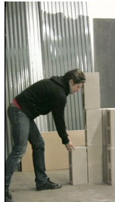
Alex Hubbard, Screens for recalling the blackout , 2009 Vidéo couleur, son, 5'33" (extrait) Collection FRAC Corse – Collectivité territoriale de Corse