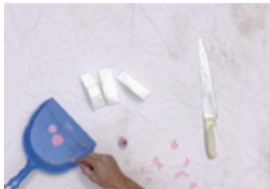
Alex Hubbard, Dos Nacionais , 2008 Video, 3'30", colour (still)