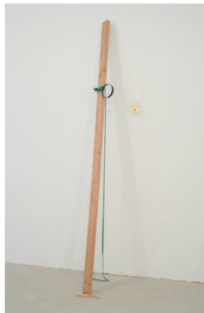
Davide Balula, Brûlure (Post It) [Burn (Post it)], 2009 Magnifying glass, wood, string, post-It note 200 x 50 x 20 cm