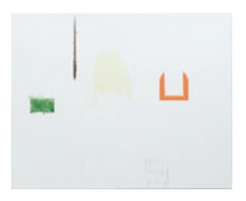
Samuel Richardot, Untitled , 2008 Mixed media on canvas, 200 x 250 cm