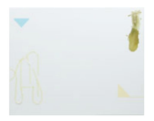
Samuel Richardot, Untitled , 2008 Mixed media on canvas, 200 x 250 cm Courtesy of the artist and Balice Hertling, Paris