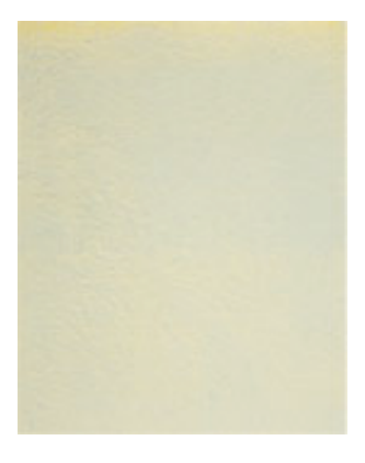
Samuel Richardot, Peau , 2008 Acrylic on canvas, 33 x 41 cm