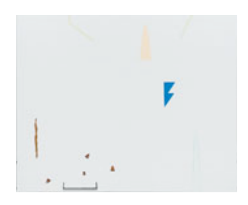
Samuel Richardot, Untitled , 2008 Mixed media on canvas, 200 x 250 cm