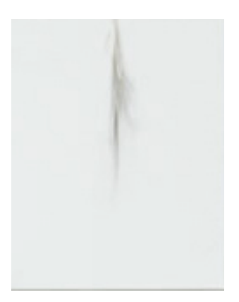
Samuel Richardot, Untitled , 2008 Burn on canvas, 33 x 41 cm