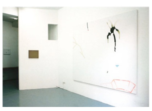
Samuel Richardot Exhibition view at Balice Hertling gallery, Paris Untitled , 2007 Mixed media on canvas, 200 x 250 cm